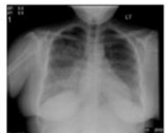
Figure 2: Infected X-rays

Manuscript Received Feb 5, 2023; Revised 25 Feb, 2023 and Published on March 30, 2023