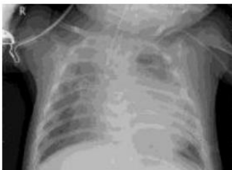
Figure 4: Viral Pneumonia

Infection that is caused by a virus is called viral infection and pneumonia is caused by a virus called viral pneumonia. Viral type of pneumonia is commonly caused by flu or even cold. Viral pneumonia spreads in three parts viruses caught the upper part of the respiratory system first and then enter into your lungs and then affects the victim's lung.