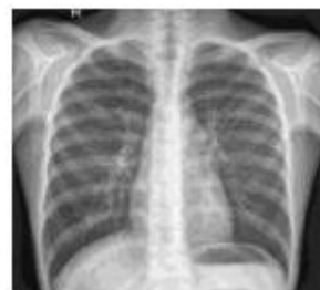
Figure 1: Normal X-rays

The difference between normal and infected X-rays is shown below respectively. The difference between normal and infected X-rays is shown below respectively.